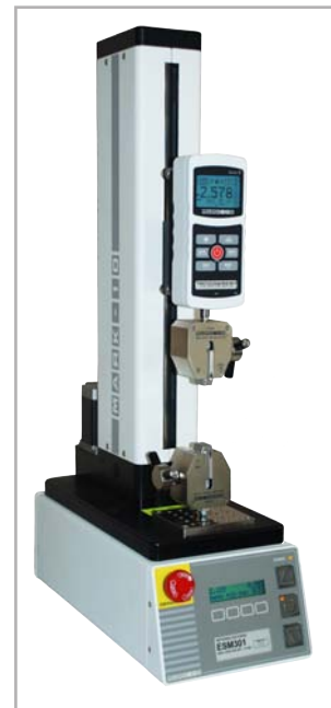
Shown with an ESM301 test stand and G1061 wedge grips

The Series 5's averaging mode addresses the need to record the average force over time, useful in applications such as peel testing, while external trigger mode makes switch activation testing simple and accurate. An ergonomic, reversible aluminum design allows for hand held use or test stand mounting for more sophisticated testing requirements. Series 5 force gauges are directly compatible with Mark-10 test stands, grips, and software.